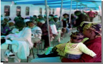
Pictures above & to the right: Communities are able to benefit through blood tests, dental care, eye tests and general health checks.

In addition to these general health services, individual counselling sessions and group workshops to help people cope with psychological issues such as stress and depression are offered.